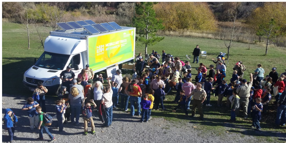
Photo showing USU providing Boy Scout education in the USU Mobile Art Truck