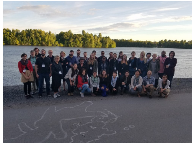
Photo: 2017 ISSRM Young Professionals Event