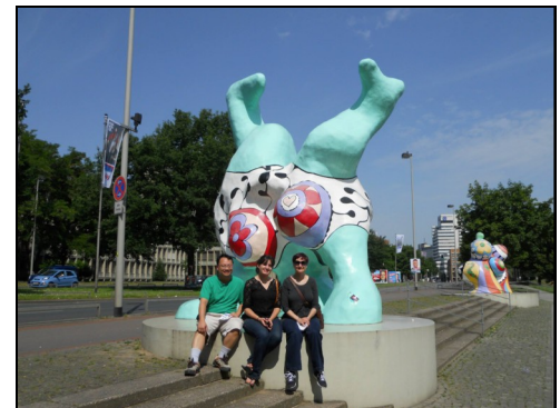
IASNR members enjoying the local culture