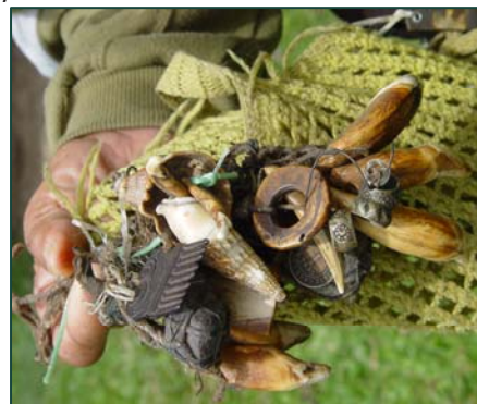
Medicinal Paraphenalia from the forest at Bundu Tuhan, Sahah, Malaysic