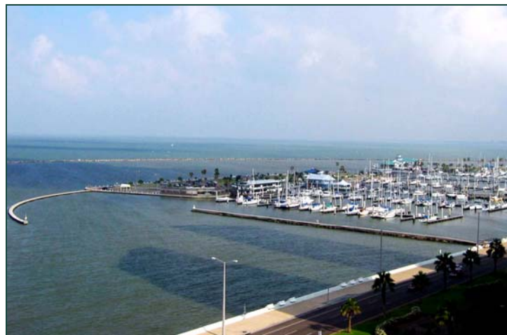
Marina of Corpus Christi