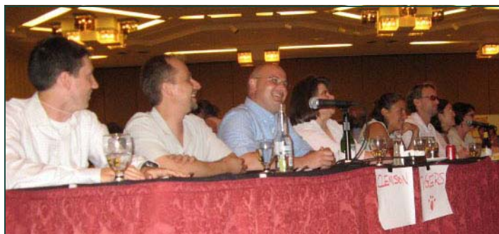
Student Quiz Bowl

Four academic teams competed in the quiz bowl. Participants from Cornell University, North Carolina State University, Texas A&M University, and Murdoch University made up the Wildcard University Team. The other three teams represented the University of Maine, Clemson University, and The Pennsylvania State University. Clemson University's team was designated the 3 rd Annual Student Quiz Bowl champion and received a $50 gift certificate from Taylor and Francis Publishing Company.