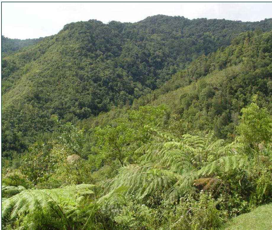
Bundu Tuhan Native Reserve, Sabah, Malaysia: Forests—Managed by Local Community