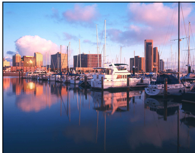
Marina Skyline - Corpus Christi

We are currently considering a possible North American site for ISSRM 2012, and hope to be prepared to announce the 2012 conference site by the time of the ISSRM 2009 conference in Vienna.