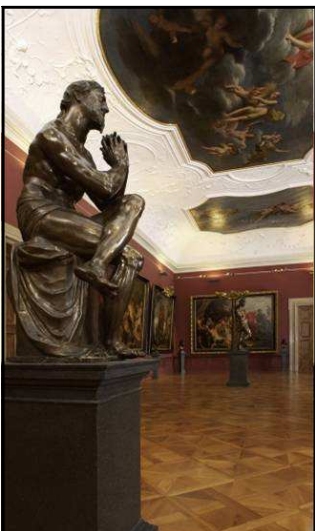
LIECHTENSTEIN MUSEUM. Die Fürstlichen Sammlungen, Wien / Sammlungen des Fürsten von und zu Liechtenstein, Vaduz – Wien.

Submission deadlines are January 20, 2009 , for coordinated session proposals and March 16, 2009 , for scientific paper and poster abstracts. Late submissions after these deadlines may be accepted, space permitting. For abstract submission and conference registration, please go to http://www.issrm09.info .