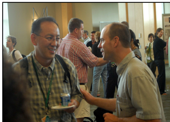
Symposium participants catch up with colleagues and share research findings during the Poster Session and Reception.